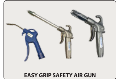
EASY GRIP SAFETY AIR GUN

If a very small nozzle is required the Model 47002AMS – 6 mm stainless steel Air Mag™ Nozzle may also be fitted to the unit.