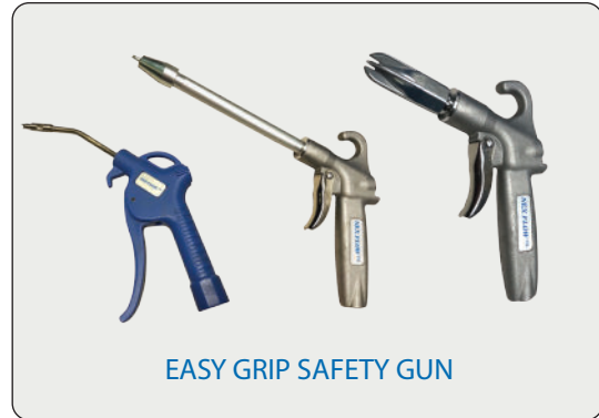
EASY GRIP SAFETY GUN

There are two types of Safety Air Blowoff Guns to choose from depending on the individual’s personal taste and comfort. See Nozzles and Jets for their technical details.