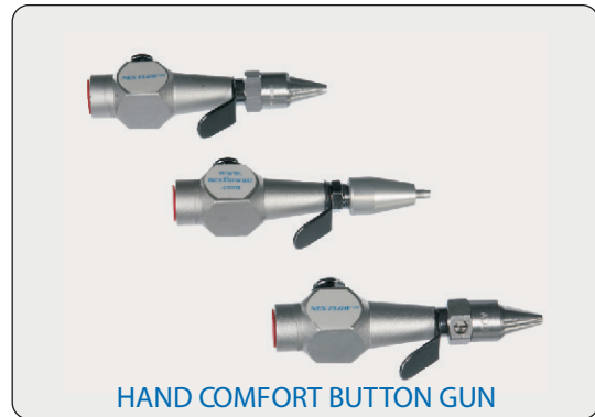
HAND COMFORT BUTTON GUN

Nex Flow™ removes the confusion from Air Jets and Nozzles. You do NOT need hundreds of different Nozzles. All air amplifying Nozzles produce air flows up to 25 times the compressed air consumed. Different Nozzles have different outlet sizes and the more air used, the greater the force produced. Noise reduction up to 10 dBA is typical as well as reduced air consumption when compared to open Jets and Tubes.